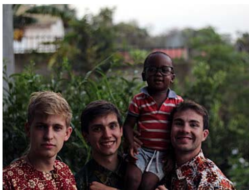
Three of the guys on our trip with the son of a woman who worked in the house where we were staying .

Whilst doing door to door evangelism in a village we ended up in a little community of connected houses. When we arrived, there were two women outside washing clothes. We started to talk to them and as we did four more joined us. They told us that two of them were born-again Christians, two were Muslim