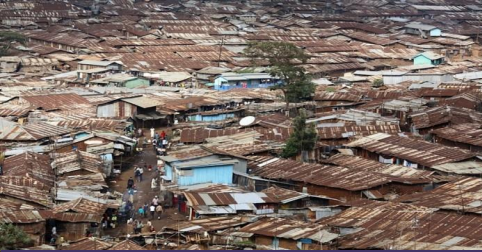
Tin roofed one-roomed houses