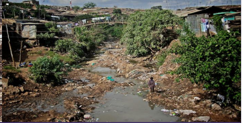
Water is always infected

They will be involved in a huge range of activities including: foot washing and shoe distribution; visiting the widows' home with food baskets; visiting a Children's home and a Young Offenders reception centre; helping at a mentoring and employment program; and speaking at church services.